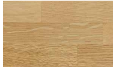
European Oak (B)