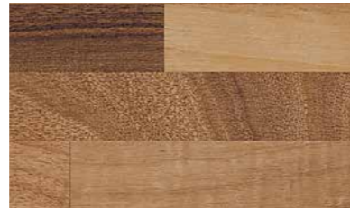
European Walnut (C)

Species shown are a representation only and colour may vary from actual product. We recommend viewing a sample before making final species selection. All timbers are nominal 32mm thickness.