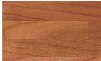
European Cherry (C)